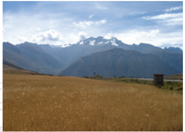
View of Chicón from Ramal de Maras

"If there is a way that the community can earn, saving natural resources will interest them," he explains. Haku Trek is a two-way learning experience - tourists learn about the region and culture and