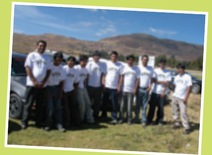
Taxistas in Leap T-shirts