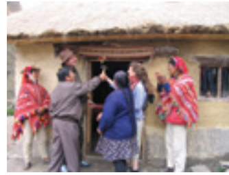
A ceremony for good luck