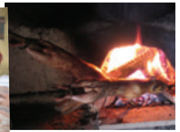
Roast guinea pig