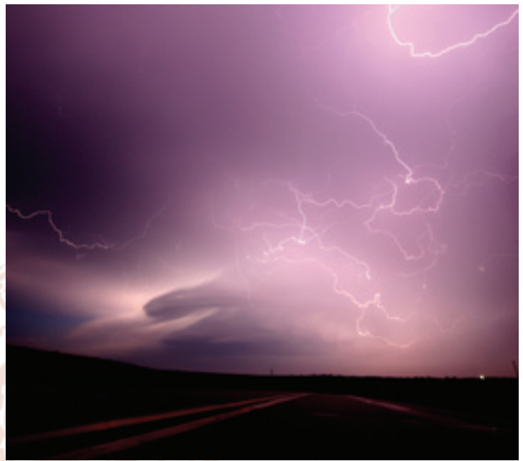
Lightning from 2008 storm chase