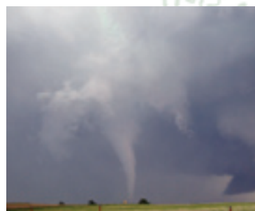
Tornado Chasing is not for the Cowardly Lion. Kansas.