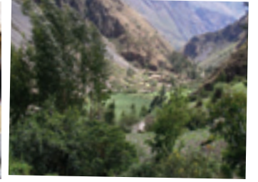
View on the cycle back