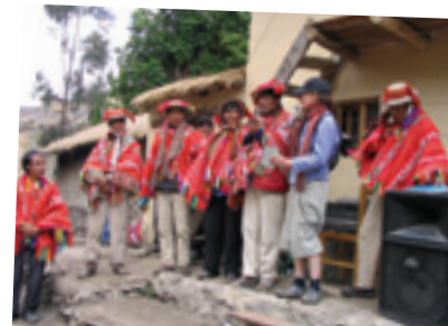
The celebrations begin with speeches