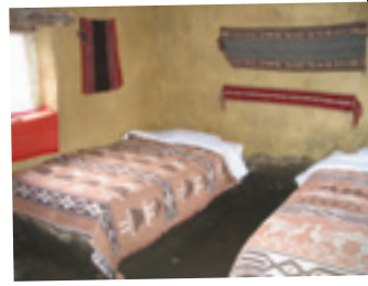
One of the homestays.

www.leaplocal.org - Use search and enter 'Patakancha' to find homestays