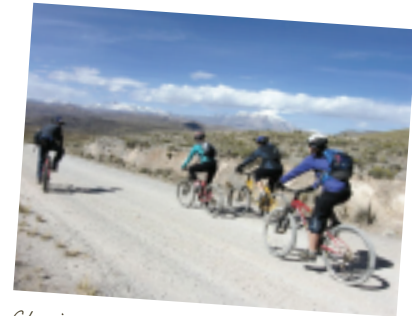
Chewing coca leaves relieves altitude sickness. Bicycling at 4300 metres in the Andes.