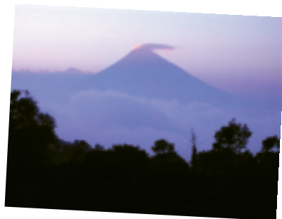
Fuego Volcano can be seen erupting from Pacaya Volcano. Guatemala.