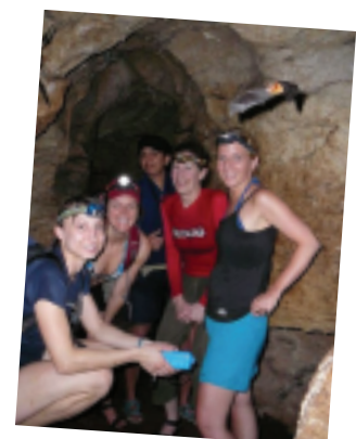
Spelunking in bat caves, Guatemala.