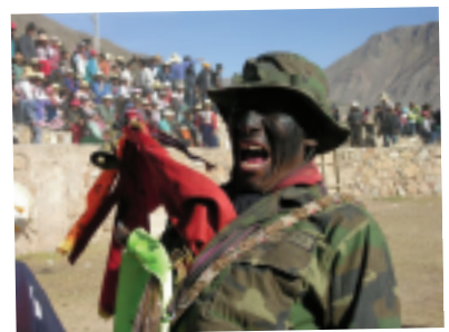
Peru Adventure Tours lives up to the 'adventure' in their name. Bullfighting ring, Huambo, Colca Canyon.