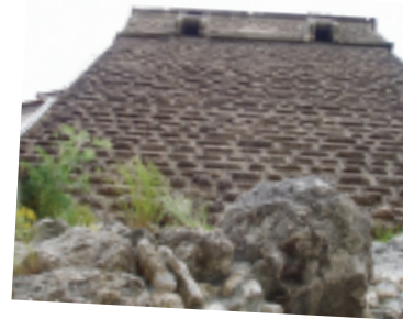
Impenetrable Bran Castle, known as Dracula's Castle, Transylvania Romania.

Peru Adventure Tours provides massive support and yet they live up to the 'adventure' in their name.